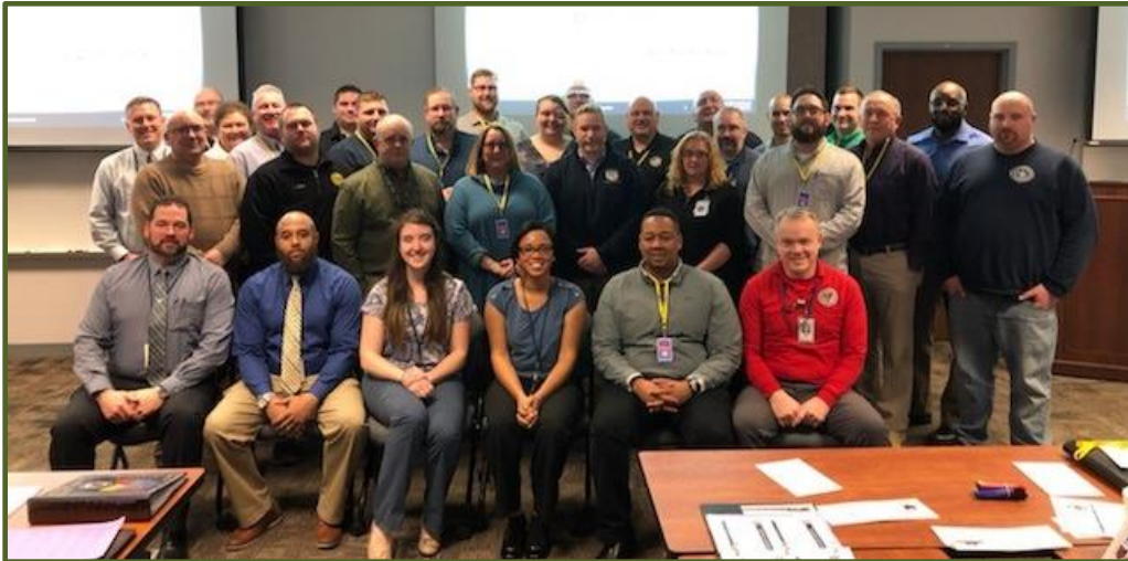
Class of 2019

The annual delivery of the OH230 Introduction to Emergency Management Course will be held February 24-27, 2020, at the Ohio Emergency Management Agency. This 3.5-day course walks students through the various components of Ohio EMA and local programs as they relate to emergency management. It gives students time to interact with state and local emergency managers, as well as many partners that attend. If interested, please register on the DPS Training Campus: https://trainingcampus.dps.ohio.gov/cm/cm710/pstc/pstc.html